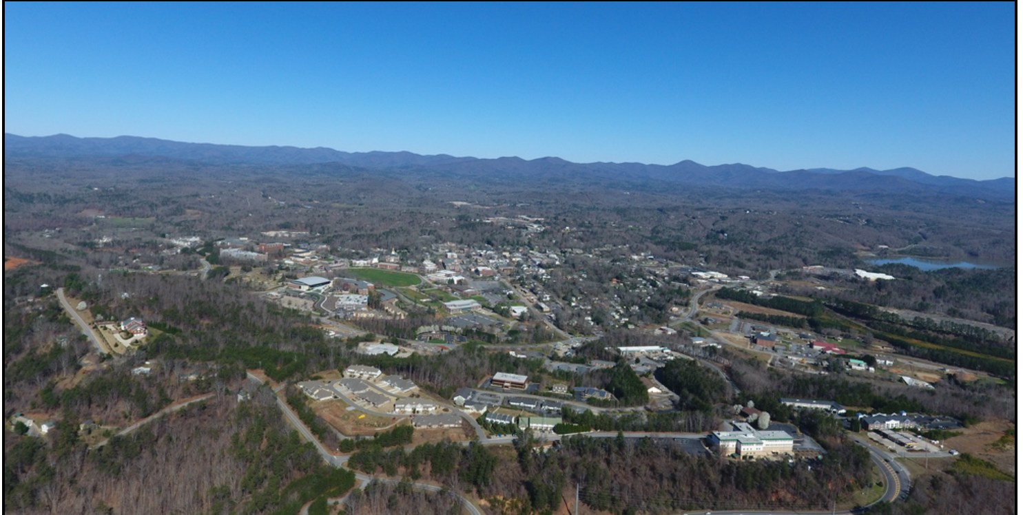
Proximity to Dahlonega