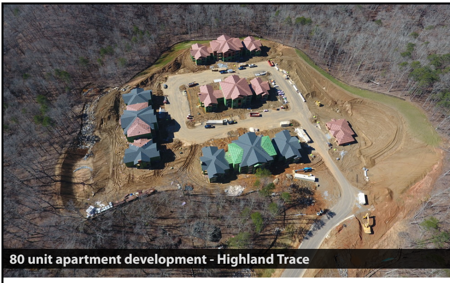
80 unit apartment development - Highland Trace